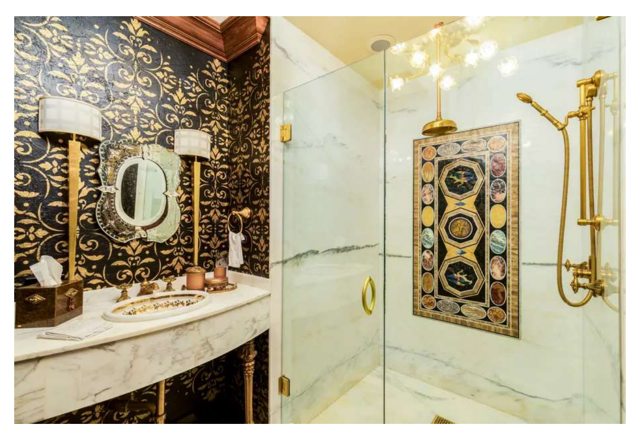
The 12,500 square feet home that's next door to Las Olas Boulevard includes an office, a courtyard, bar, and gym. Other perks include two master closets, laundry room, club room, and library.