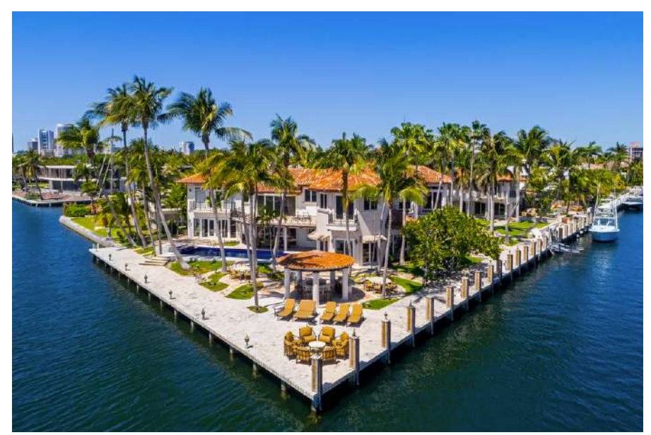
While the Fort Lauderdale waterfront property does not include furniture as part of its asking price, it's difficult to miss the stunning 18th and 19th century home decor.