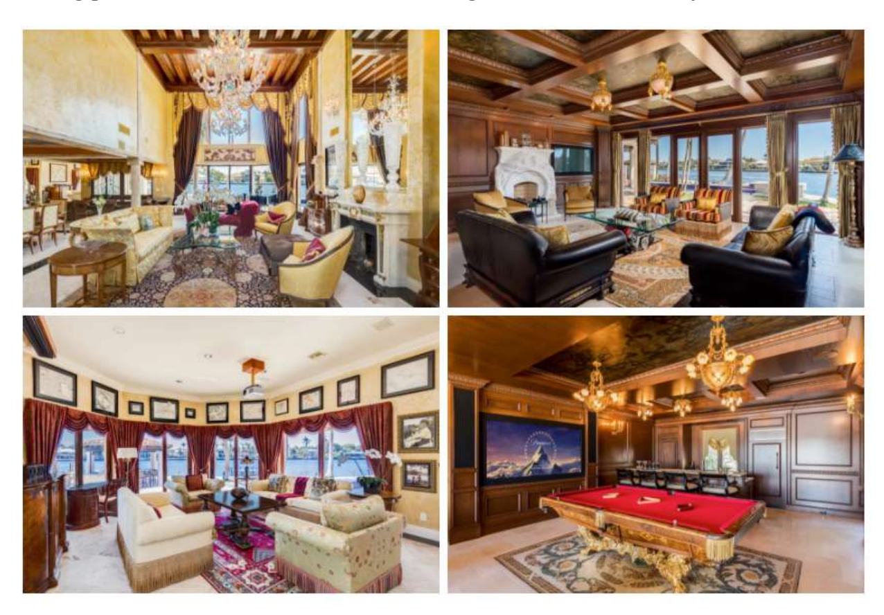
The home has some of the same Venetian designs as the Versace mansion—soaring ceilings, stenciled wall plasters, marble floors, antique sconces and chandeliers, and mural ceilings inspired by Italian palaces.